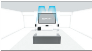
Dolby Atmos 3.1.2ch Speaker System

The VSX-534D is compatible with 3.1.2ch configuration of the latest cinema sound platform, DOLBY ATMOS® . You can reproduce object-oriented sound in smooth, curving movements, or the realistic three-dimensional movement overhead by the top speakers. Other audio codecs such as PCM and DSD can be upmixed using Dolby Surround for enjoying 3D surround sound.