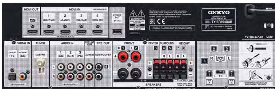
Text on receiver may vary with region.

Due to a policy of continuous product improvement, Onkyo reserves the right to change specifications and appearance without notice. Manufactured under license from Dolby Laboratories. Dolby, the double-D symbol, Dolby Atmos, Dolby Surround, Dolby Vision, and Dolby TrueHD are trademarks of Dolby Laboratories. For DTS patents, see http://patents.dts.com . Manufactured under license from DTS, Inc. DTS, the Symbol, DTS and the Symbol together, DTS:X and the DTS:X logo, DTS Virtual:X and the DTS Virtual:X logo, DTS Neural:X and the DTS Neural:X logo and the DTS-HD Master Audio logo are registered trademarks or trademarks of DTS, Inc. in the United States and/or other countries. © DTS, Inc. All Rights Reserved. The terms HDMI and HDMI High-Definition Multimedia Interface, and the HDMI Logo are trademarks or registered trademarks of HDMI Licensing Administrator, Inc. in the United States and other countries. The Bluetooth® word mark and logos are registered trademarks owned by Bluetooth SIG, Inc. Products displaying the Hi-Res Audio logo conform to the Hi-Res Audio standard as defined by Japan Audio Society. The Hi-Res Audio logo is used under license from Japan Audio Society. AccuEQ and Music Optimizer are trademarks of Onkyo Corporation. All other trademarks and registered trademarks are the property of their respective holders.